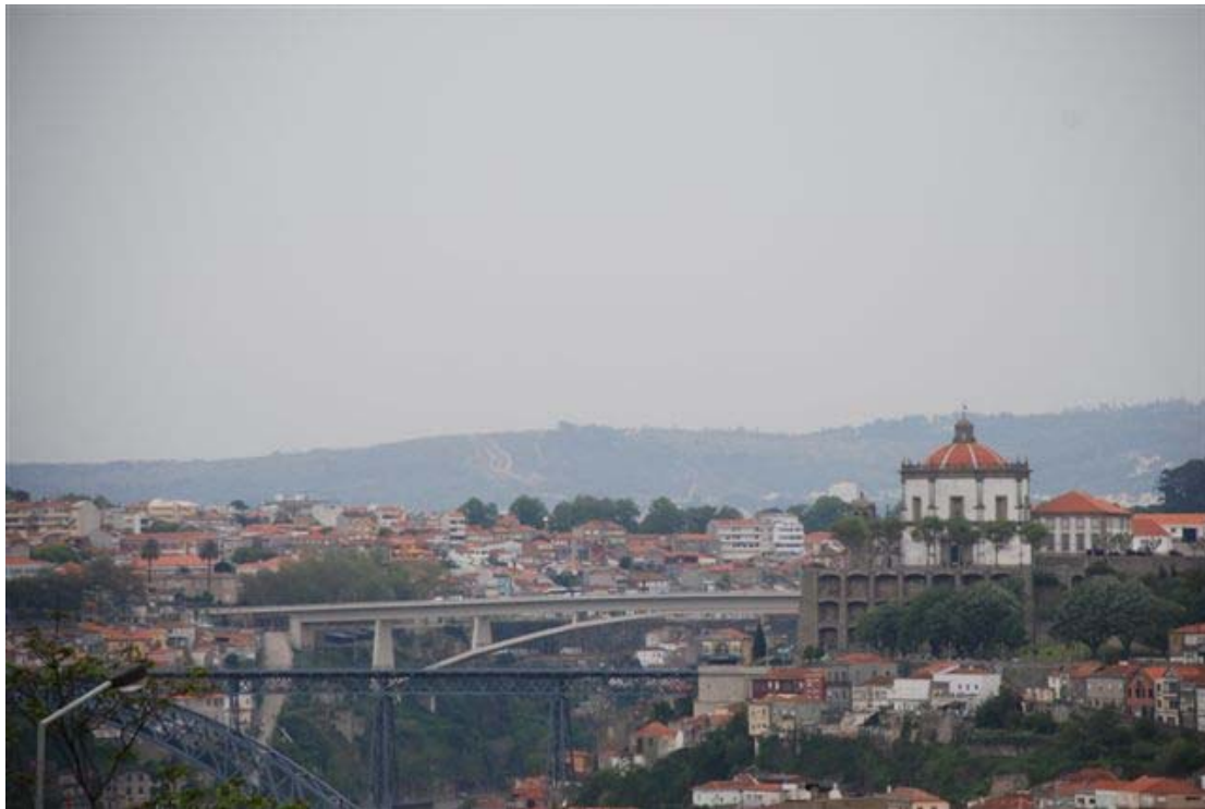
City of Vila Nova de Gaia