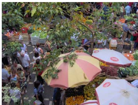
Funchal Municipal Market, Madeira Island